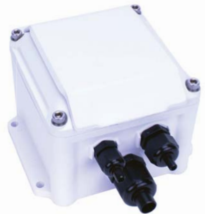
Protective Cover Closed